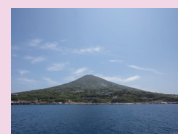
[Toshima] Entire view