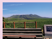
[Oshima] Top of Mt. Mihara

From 3/25 to 31, ferries that go from Tateyama to Oshima, Toshima, Nijijima, Shikinejima, and Kozushima are in daily operation!!