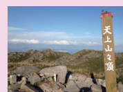
[Kozushima] Mt. Tenjo