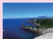
[Shikinejima] Observatory at Kanbiki