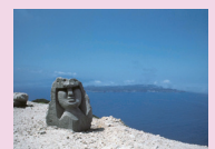
[Nijijima] Observatory at Mt. Mukai